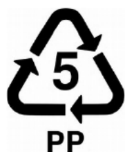
(Image not to scale)

The primary packaging of the proposed MRTP is a child-resistant container and consists of a 21 Code of Federal Regulations (CFR) 177.1520(c)-compliant polypropylene can (container) and lid. The container and the lid of the new “other tobacco product” product is composed of recyclable polypropylene resin with the resin identification code “5” contained within the Universal Recycling Symbol stamped into each respective component: